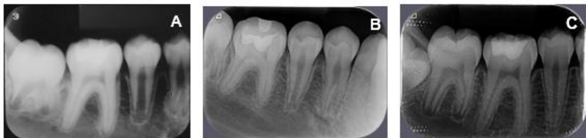
Figure5. Periapical radiographs of element 46. (A) - Prior to treatment. (B) - 6 months after initiation of treatment. (C) - 18 months after initiation of treatment.