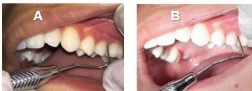
Figure6. Periodontal probing of the mesial site of element 26. (A) - before treatment (7 mm). (B) - 6 months after treatment (5 mm)