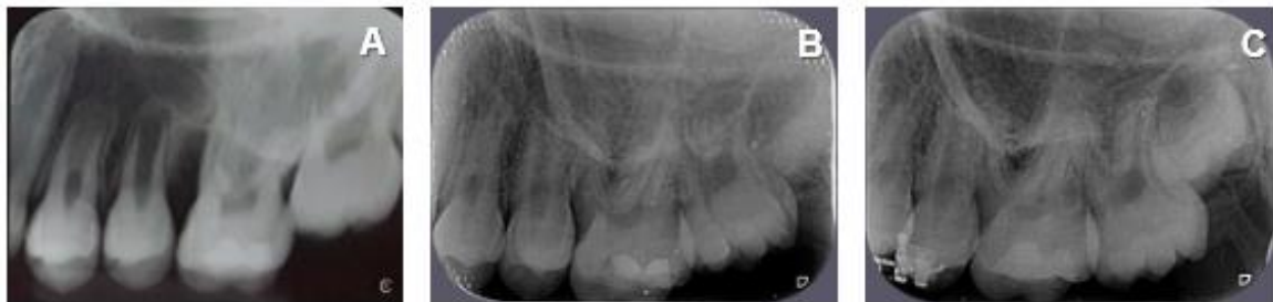
Figure3. Periapical radiographs of element 26. (A) - Prior to treatment. (B) - 6 months after initiation of treatment. (C) - 18 months after initiation of treatment