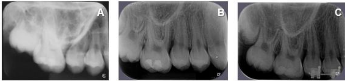
Figure2. Periapical radiographs of element 16. (A) - Prior to treatment. (B) - 6 months after initiation of treatment (4 months after surgery). (C) - 18 months after initiation of treatment (16 months after surgery).