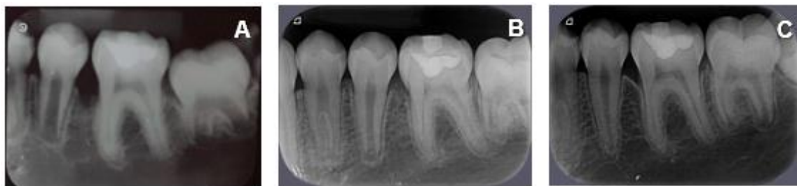
Figure4. Periapical radiographs of element 36. (A) - Prior to treatment. (B) - 6 months after initiation of treatment. (C) - 18 months after initiation of treatment.