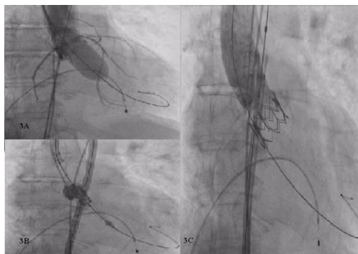
Figure3. TAVI operation is seen. 3A: Predilatation phase is seen. 3B: Bioprosthesis valve placed in aortic valve position. 3C: Image taken after cover implantation.

aortic regurgitation and complication. (Figure 3).