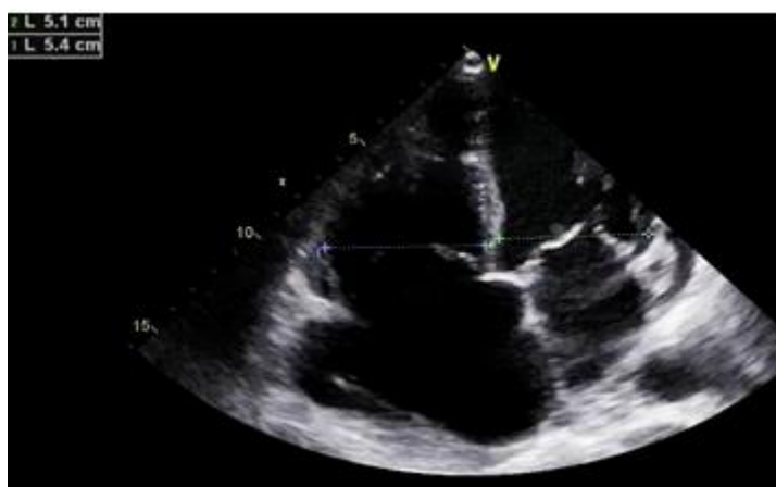
Figure2: Significant expansion of right cavities

Tricuspid valve shows a lack of coaptation affecting the three leaflets which is responsible for massive tricuspid regurgitation (see figure 3).