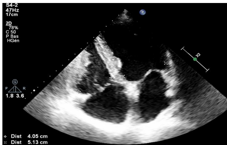
Figure5: Regression of the dilation of right ventricle (Right-ventricular basal diameter went from 54mm to 40.5mm)