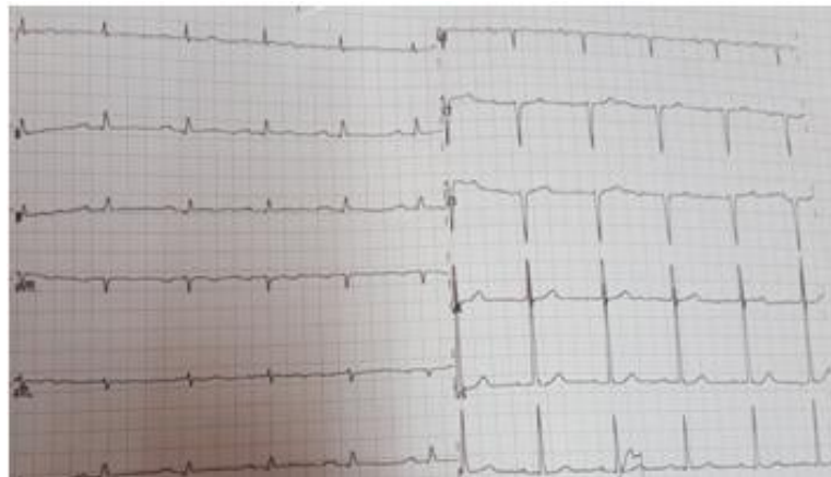
Figure4: Electrocardiogram showing return to sinus rhythm after 40 days of synthetic antithyroid treatment

from 53 kg to 44kg). After discharge, the patient has been followed during 9 months. Rhythm control was obtained after 40 days of synthetic antithyroid treatment (see Figure 4).