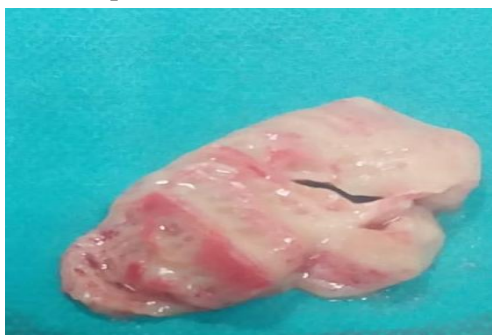
Figure2: Image of the operating part of the apical mass whose thrombotic nature is confirmed by the anatomopathological study

The patient was operated in an emergency with thrombectomy whose anatomopathological study confirmed this diagnosis and then put on anticoagulant and antiplatelet agent associated with vitamins and trace elements supplementation. Once treatment established, the patient did not present a recurrent thrombotic episode.